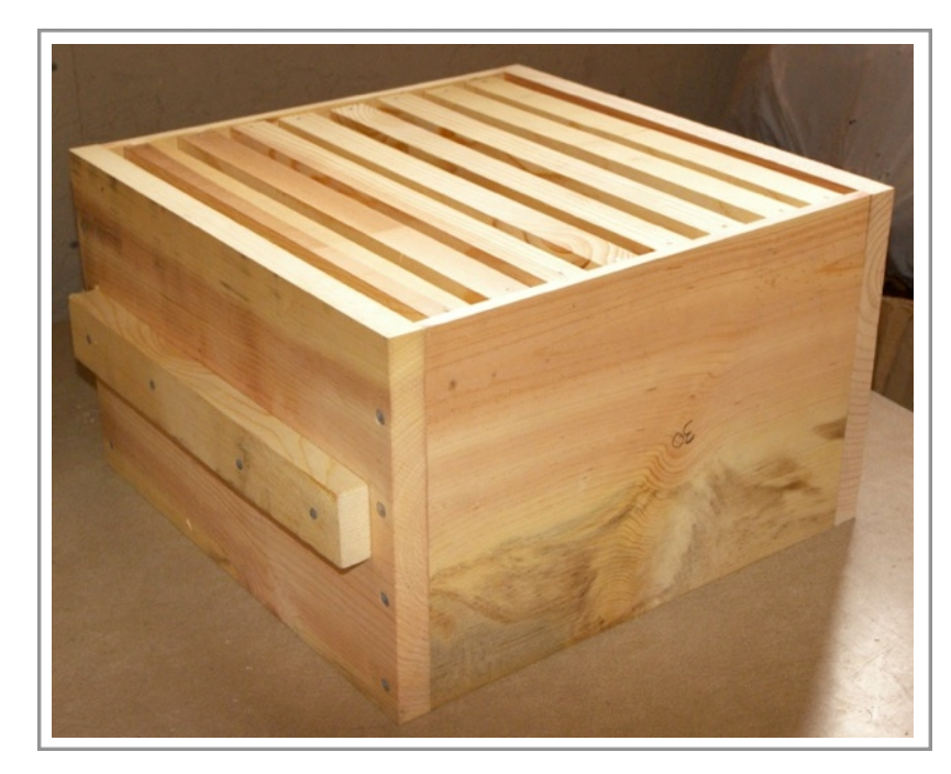
Hive Box with all 8 top bars

Each Hive Box has its own set of Top Bars. When the hive boxes are stacked on top of each other, the top bars in each box provide a foundation for the bees to build comb on.