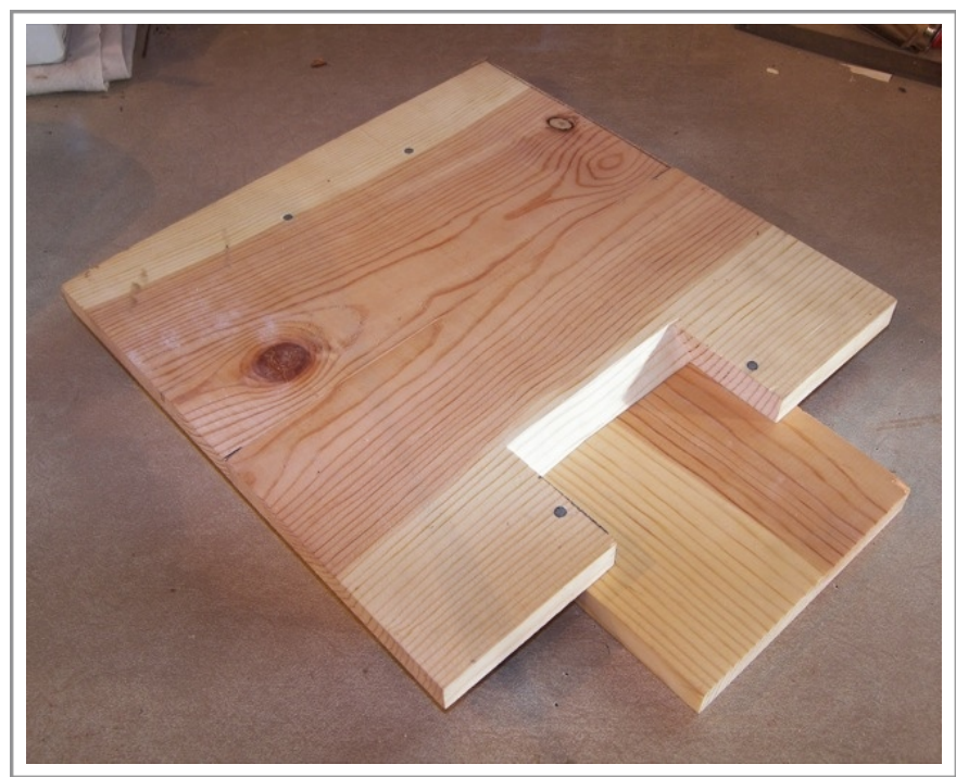
Warre Hive Floor without legs