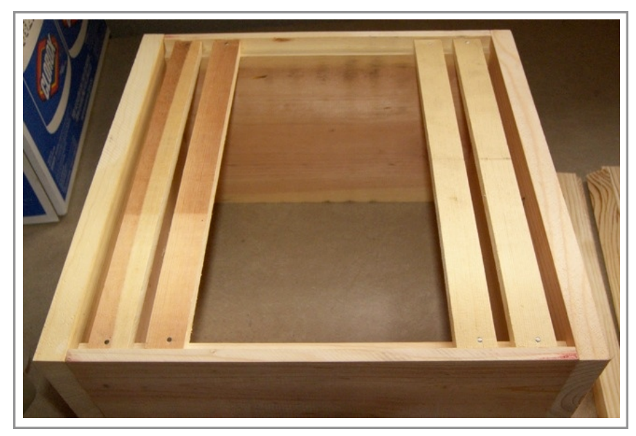
Hive Box with 4 top bars