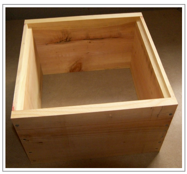
Warre Hive Box with No Top Bars