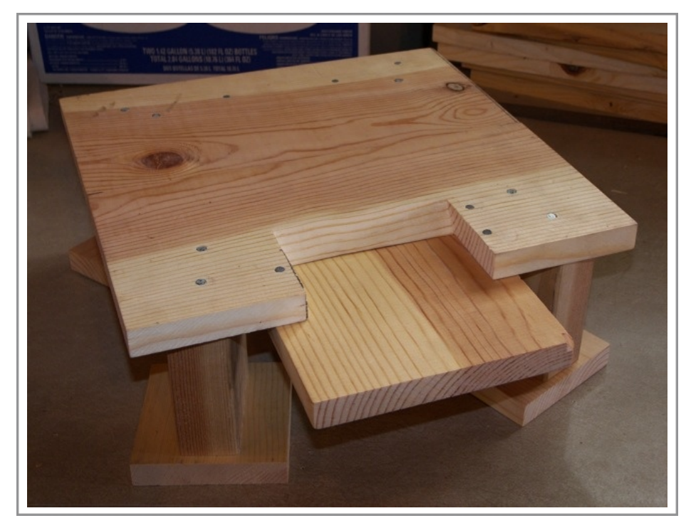
Warre Hive Floor with 4 legs

This provides the foundation for the whole beehive.