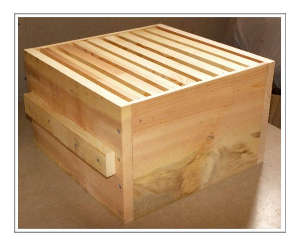
Warre Hive Box with Top Bars in place

Forms the basis of the hive. This is where the bees build their honeycomb.